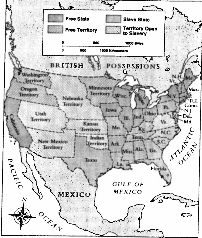
THE UNITED STATES AFTER THE KANSAS-NEBRASKA ACT OF 1854

It sealed the Missouri Compromise that had lasted more than three decades. After 1854, the sectional forces exploded, both in Kansas and in the rest of the country.