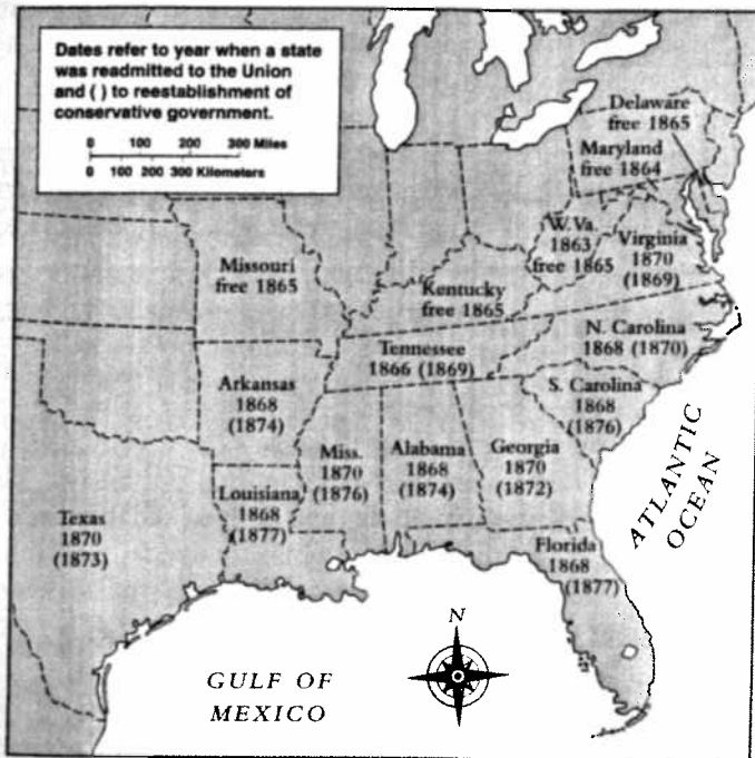
CONGRESSIONAL RECONSTRUCTION 1865–1877

Local politics in the Grant years were equally scandalous. In New York City, William Tweed, the boss of the local Democratic party, master-minded dozens of schemes for helping himself and cronies to large chunks of graft. The Tweed Ring virtually stole about $200 million from New York's taxpayers before The New York Times and the cartoonist Thomas Nast exposed "Boss" Tweed and brought about his arrest and imprisonment in 1871.