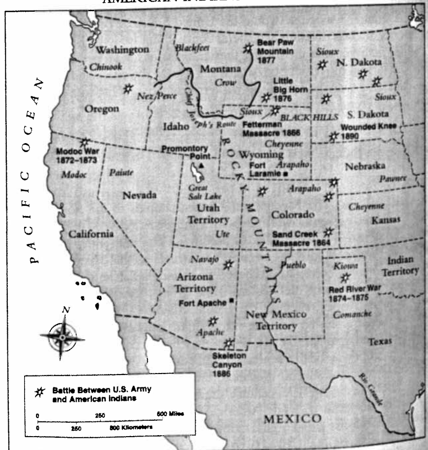
AMERICAN INDIANS IN THE WEST

Indian Wars In the late 19th century, the settlement of thousands of miners, ranchers, and homesteaders on American Indian lands led to violence. Fighting between U.S. troops and Plains Indians was often brutal, with the U.S. Army responsible for several massacres. In 1866, during the Sioux War, the tables were turned when an army column under Captain William Fetterman was wiped out by Sioux warriors. Following these wars, another round of treaties attempted to isolate the Plains Indians on smaller reservations with federal