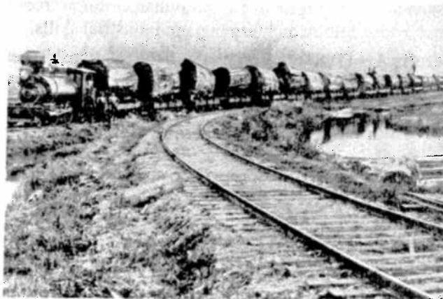
Source: Logging in California, 1909.

The concerns over deforestation sparked the conservation movement, and the breathtaking paintings and photographs of western landscapes helped to push Congress to preserve such western icons as Yosemite Valley as a California state park in 1864 (a national park in 1890), and to dedicate the Yellowstone area as the first