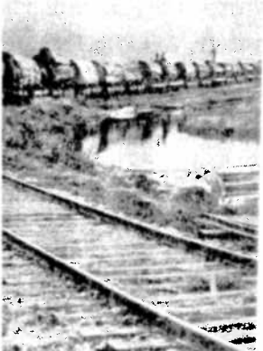
9. Library of Congress

ed the conservation movement, and the development of western landscapes helped to push Congress to designate Yosemite Valley as a California state park and to dedicate the Yellowstone area as the first