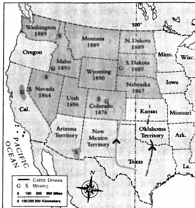
STATES ADMITTED TO THE UNION 1864–1896

In only 35 years, conditions on the Great Plains changed so dramatically that the frontier largely vanished. By 1900, the great buffalo herds had been wiped out. The open western lands were fenced in by homesteads and ranches, crisscrossed by steel rails, and modernized by new towns. Ten new western states had been carved out of the last frontier. Only Arizona, New Mexico, and Oklahoma remained as territories awaiting statehood. Progress came at a cost. The frenzied rush for the West's natural resources not only nearly exterminated the buffalo, but also seriously damaged the environment. Most significantly, the American Indians who lived in the region paid a high human and cultural price as land was settled by miners, ranchers, and farmers.