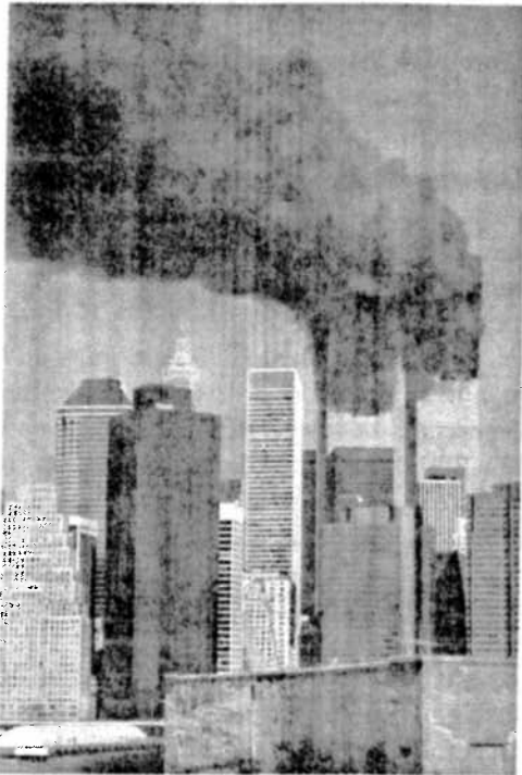
Source: World Trade Center, September 11, 2001. Wikimedia Commons/Michael Foran

Early Terrorist Attacks A truck bombing of the World Trade Center in New York City in 1993 that killed six people brought home for the first time the threat posed by Islamic extremists. In 1998, the United States responded to the terrorist bombing of two U.S. embassies in Kenya and Tanzania by bombing Al-